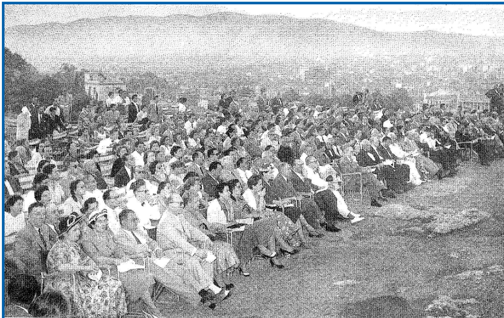
Closing Ceremony on the Pynx The International Congress of Jurists, Athens (1955)

The Committee on Labour Law of the International Congress of Jurists declares that according to the results of the investigations carried out by it a direct violation exists of the Universal Declaration of Human Rights of the United Nations of 1948 and in particular of Articles 12, 23, 24, 25 and 26 of the above Declaration.