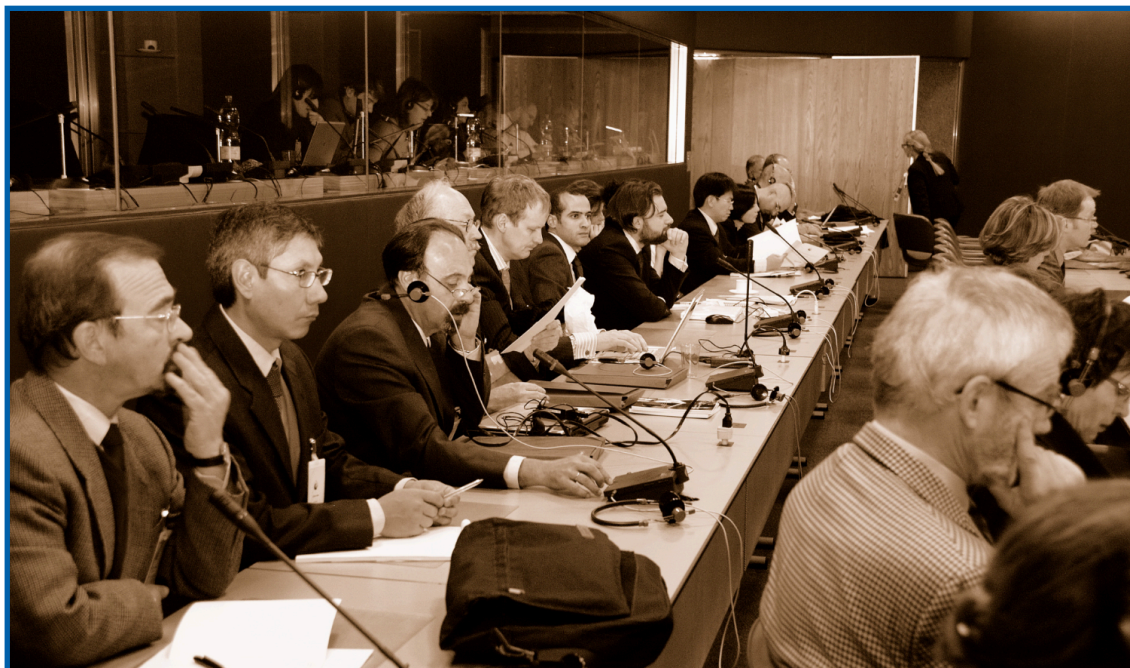
ICJ World Congress, Geneva (2008)

12. The integrity of the judicial system is central to the maintenance of a democratic society. Impartiality of the judiciary requires that cases be decided only on the basis of lawfully and fairly obtained evidence and on the application in good faith of the law, free from any extraneous influences, inducements, pressure, threats or interference, direct or indirect, from any quarter or for any reason.