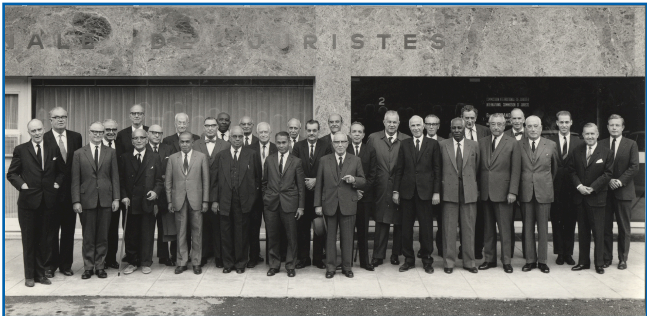
Members of the ICJ Commission at ICJ Headquarters, Geneva (1966)

The colloquium considered such matters as problems arising from the nationalization of property and examined how the citizen could be provided with an informal and prompt means of redress of grievances in dealings with the government.