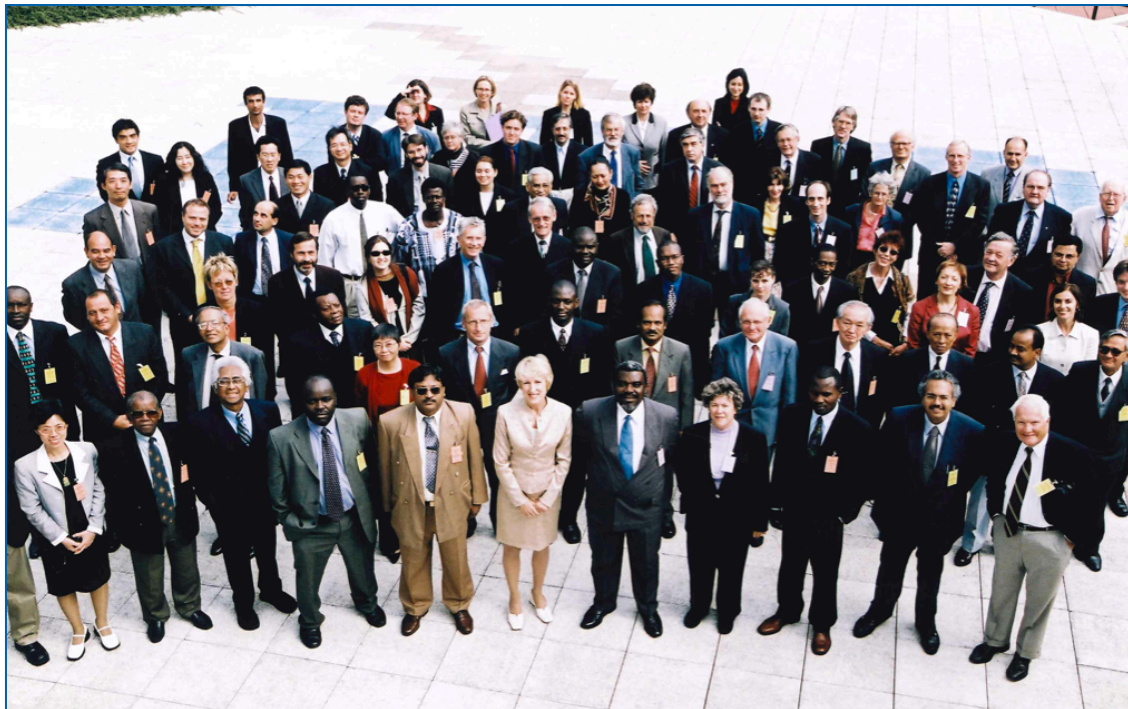
ICJ Commission, September 2001

icj.wpengine.netdna-cdn.com/wp-content/uploads/2012/10/ICJ-Statute-Final-20121.pdf