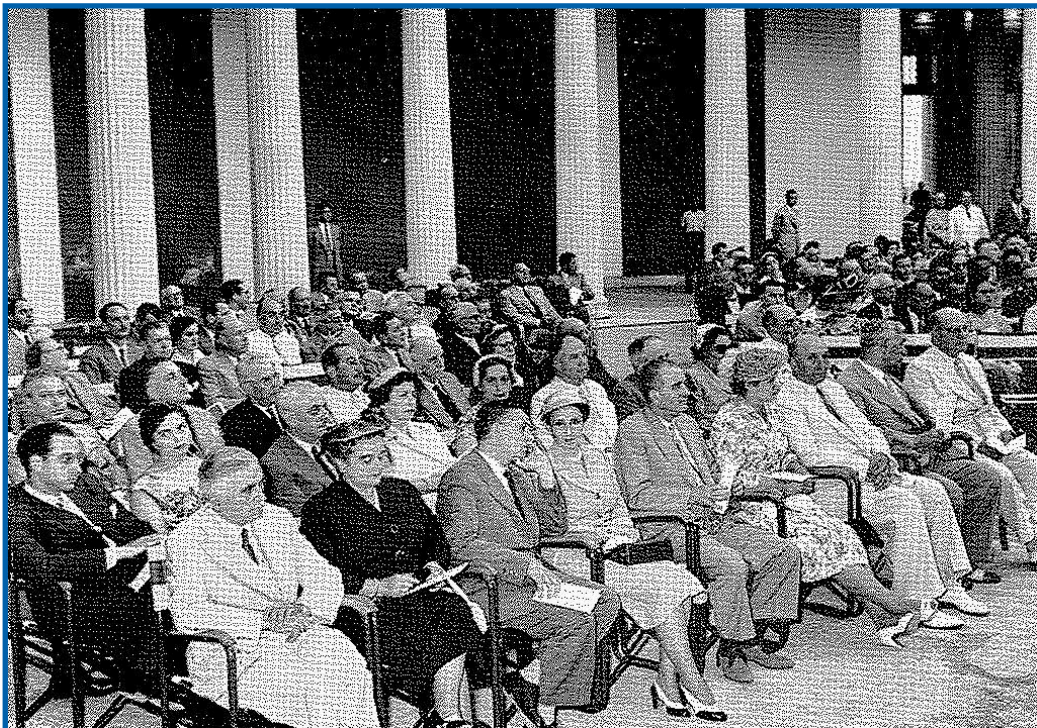
The International Congress of Jurists, Athens (1955)