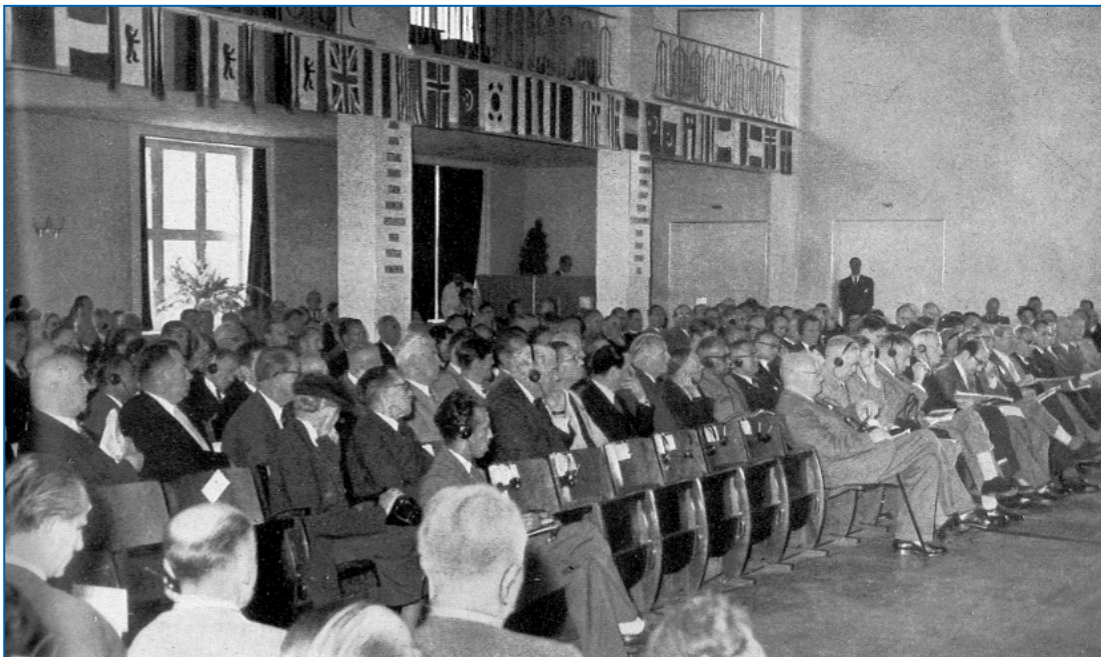
Opening Meeting of the International Congress of Jurists, 25 th July 1952

The Congress functioned as a tribunal to review the ICJF's complaints of injustice in the Soviet Zone. Assembled jurists heard witnesses and reviewed documents presented by the ICJF. The Congress focused almost exclusively on the situation in the Soviet Zone of Europe. It was claimed that British and Dutch jurists resisted an Indian delegate's efforts to discuss other human rights issues, such as racial discrimination in South Africa and decolonization.