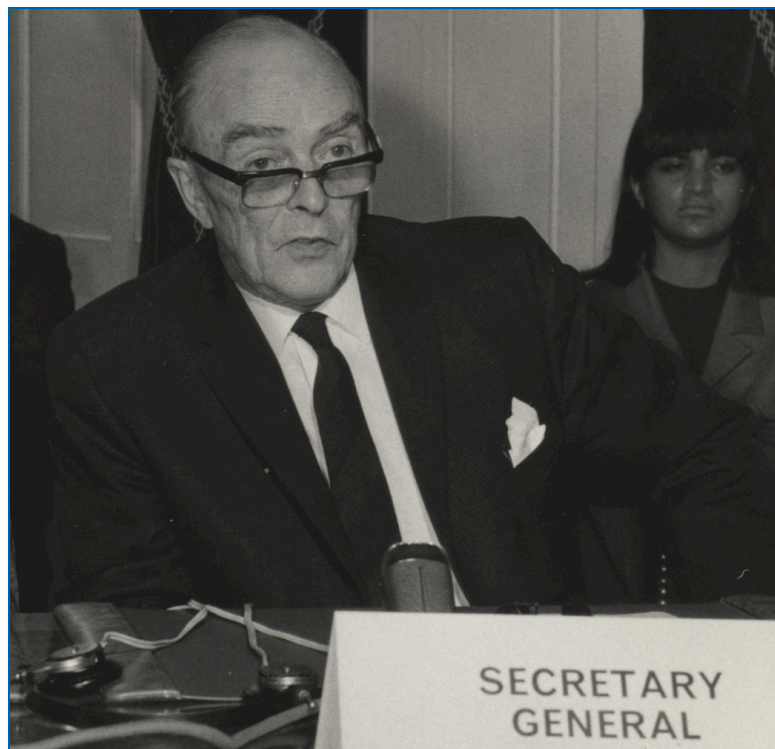
ICJ Secretary-General Sean MacBride (1963 – 1971)

This Conference requests the International Commission of Jurists to consider the feasibility of the establishment of a South-East Asian and Pacific Law Institute to realise the foregoing objectives.