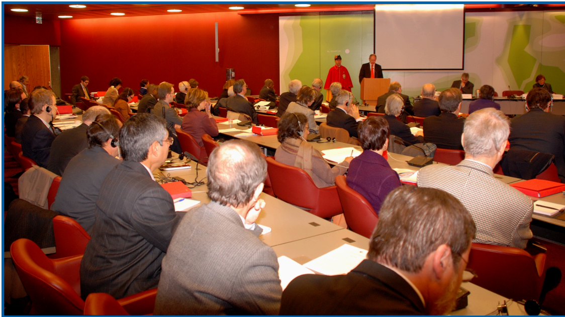
ICJ World Congress, Geneva (2008)

Reaffirming its primary mission to uphold the principles of the Rule of Law, the independence of the judiciary and the legal profession and human rights;