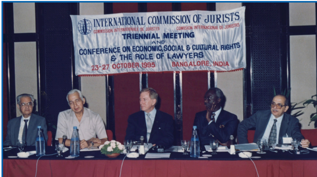
Conference in Bangalore, India (1995)