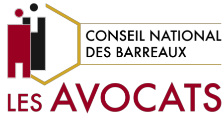
Conseil National des Barreaux (CNB) - French National Bar