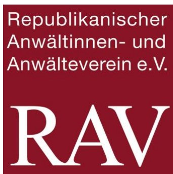
Lawyers Association RAV (Germany)