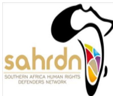
Southern Africa Human Rights Defenders Network