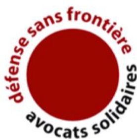
Défense sans Frontière - Avocats Solidaires (DSF AS)