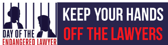
Foundation Day of the Endangered Lawyer (Netherlands)