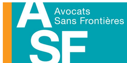
Avocats Sans Frontières (ASF) Belgique