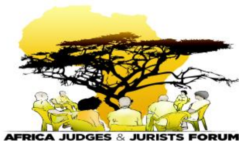
Afrika Judges and Jurists Forum (AJJF)