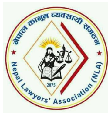
Nepal's Lawyers Association (NLA)