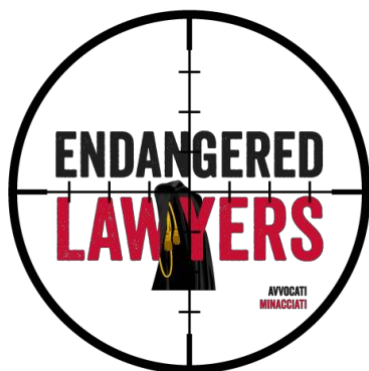
Endangered Lawyers (Italy)